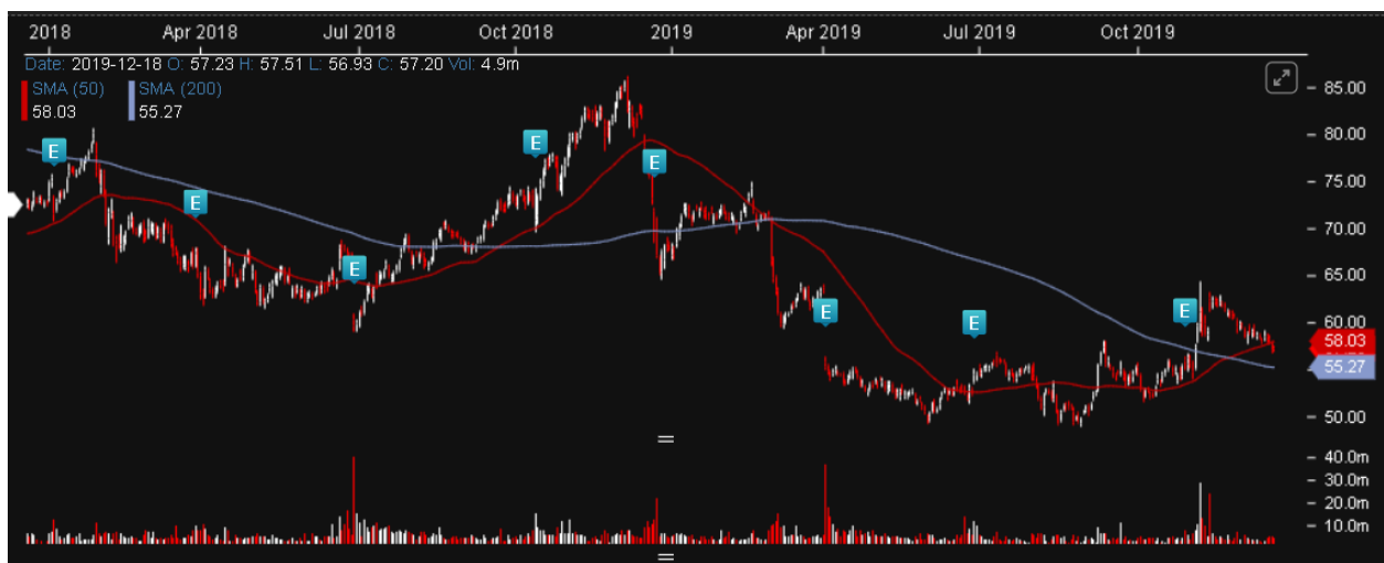
2 YEAR WBA CHART

The fundamentals for WBA are in flux. Year over Year earnings are flat and WBA faces an uncertain future in drug distribution/pharmacy. WBA is a giant in this area and the extent AMZN hits margins in that space remains to be seen. The flip side is WBA is a strong company, massive retail footprint and trading at 9 P/E. 3.25% Dividend Yield is not too bad either.